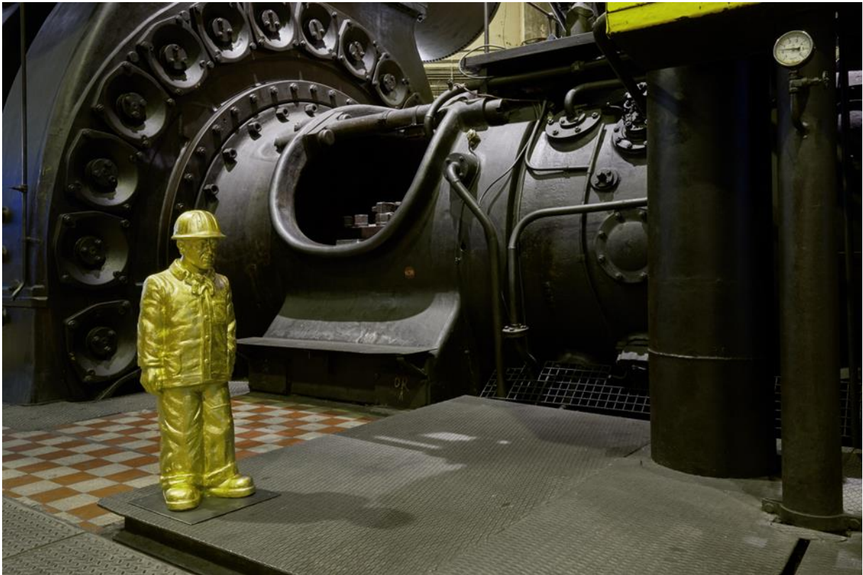
Ottmar Hörl, SECOND LIFE - 100 Arbeiter [100 Labourers] , 2018, Völklingen Ironworks World Cultural Heritage Site – European Centre of Art and Industrial Culture, Völklingen, photo: Oliver Dietze