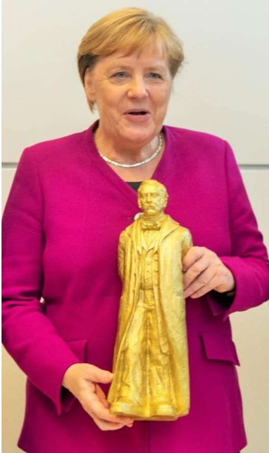
Angela Merkel with Fontane sculpture, 2019