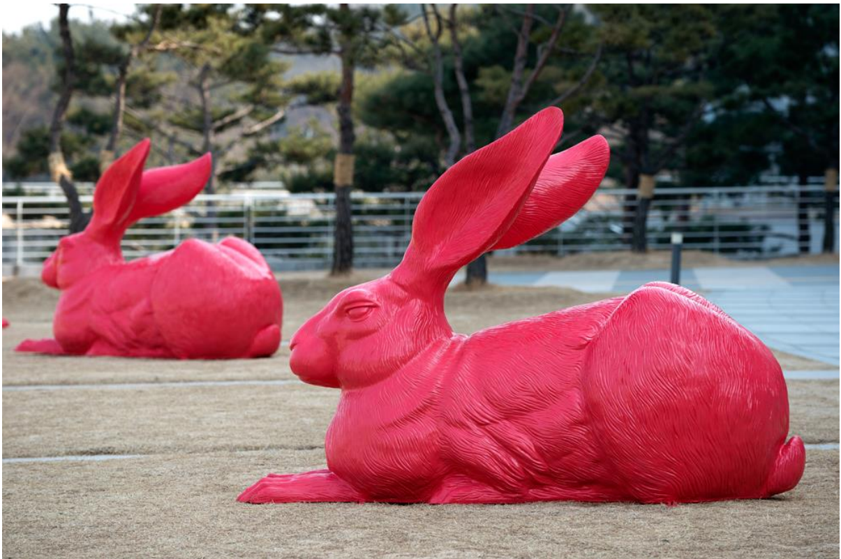
Ottmar Hörl, Homage to Dürer , 2015, Daegu Art Museum, Daegu, South Korea