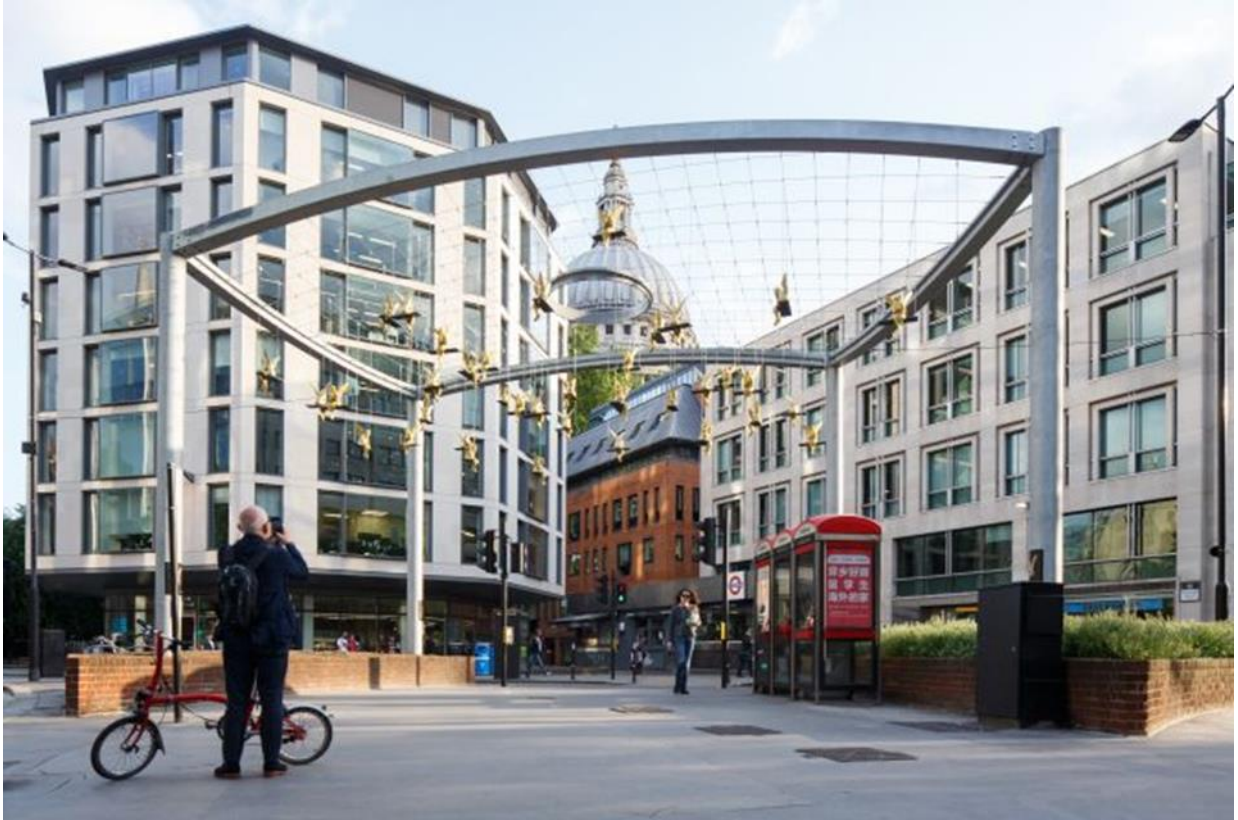
Ottmar Hörl, LUNCH BREAK , 2019, London, photo: Luke O'Donovan