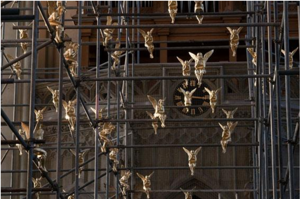
Ottmar Hörl, Engel über München [Angels over Munich] , 2009, Heilig-Kreuz-Kirche [Church of the Holy Cross], Giesing, Munich