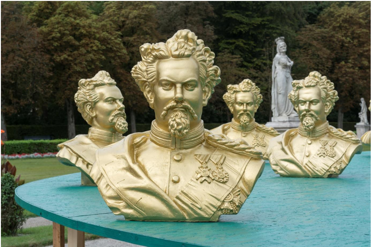
Ottmar Hörl, König Ludwig II. [King Ludwig II] , 2018, Nymphenburg Palace grounds, Munich