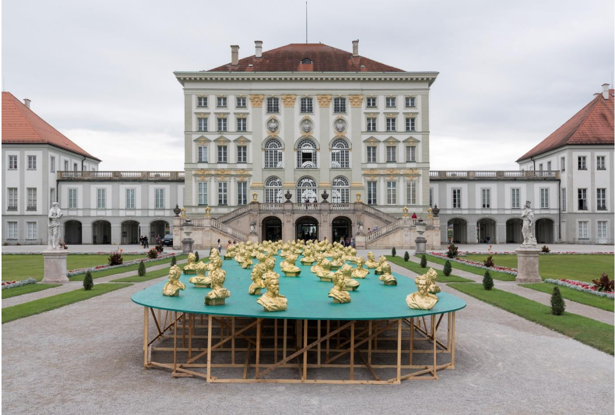
Ottmar Hörl, König Ludwig II. [King Ludwig II] , 2018, Nymphenburg Palace grounds, Munich