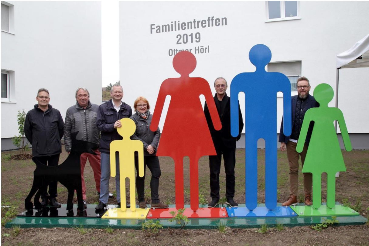
Ottmar Hörl, Familientreffen [Family Gathering] , 2019, serial steel sculptures, Rüsselsheim-Königstädten, photo: gewobau Rüsselsheim/www.frank-moellenberg.de