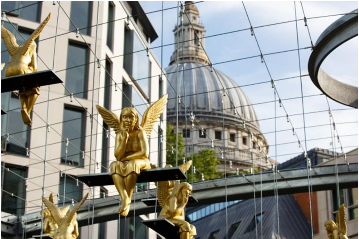
Ottmar Hörl, LUNCH BREAK , 2019, London