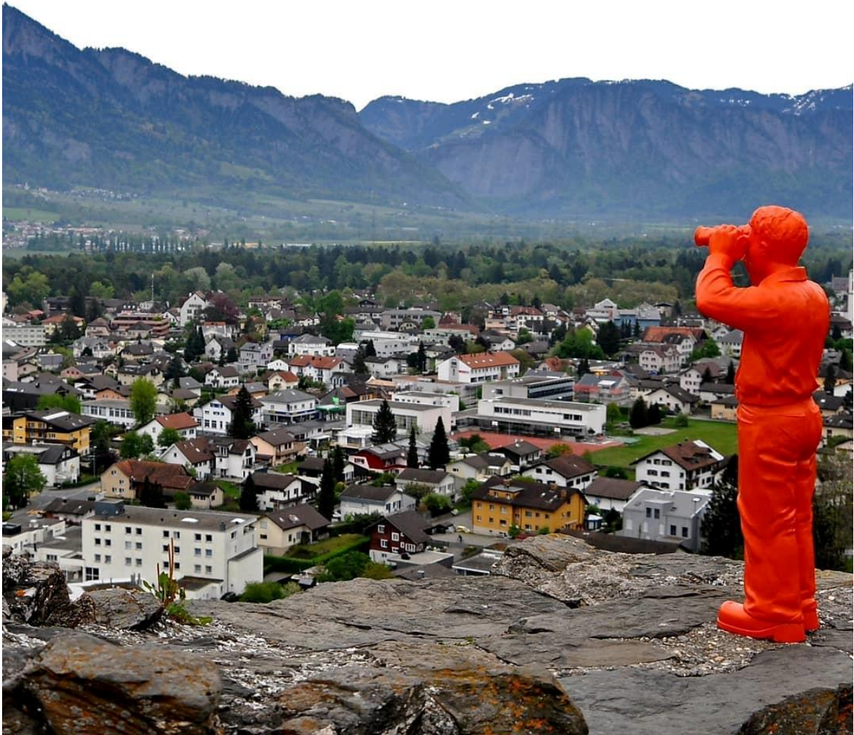
Ottmar Hörl, Weltanschauungsmodell III [Worldview Model III] , 2021, Bad Ragartz, 8th Swiss Triennial of Sculpture in Bad Ragatz