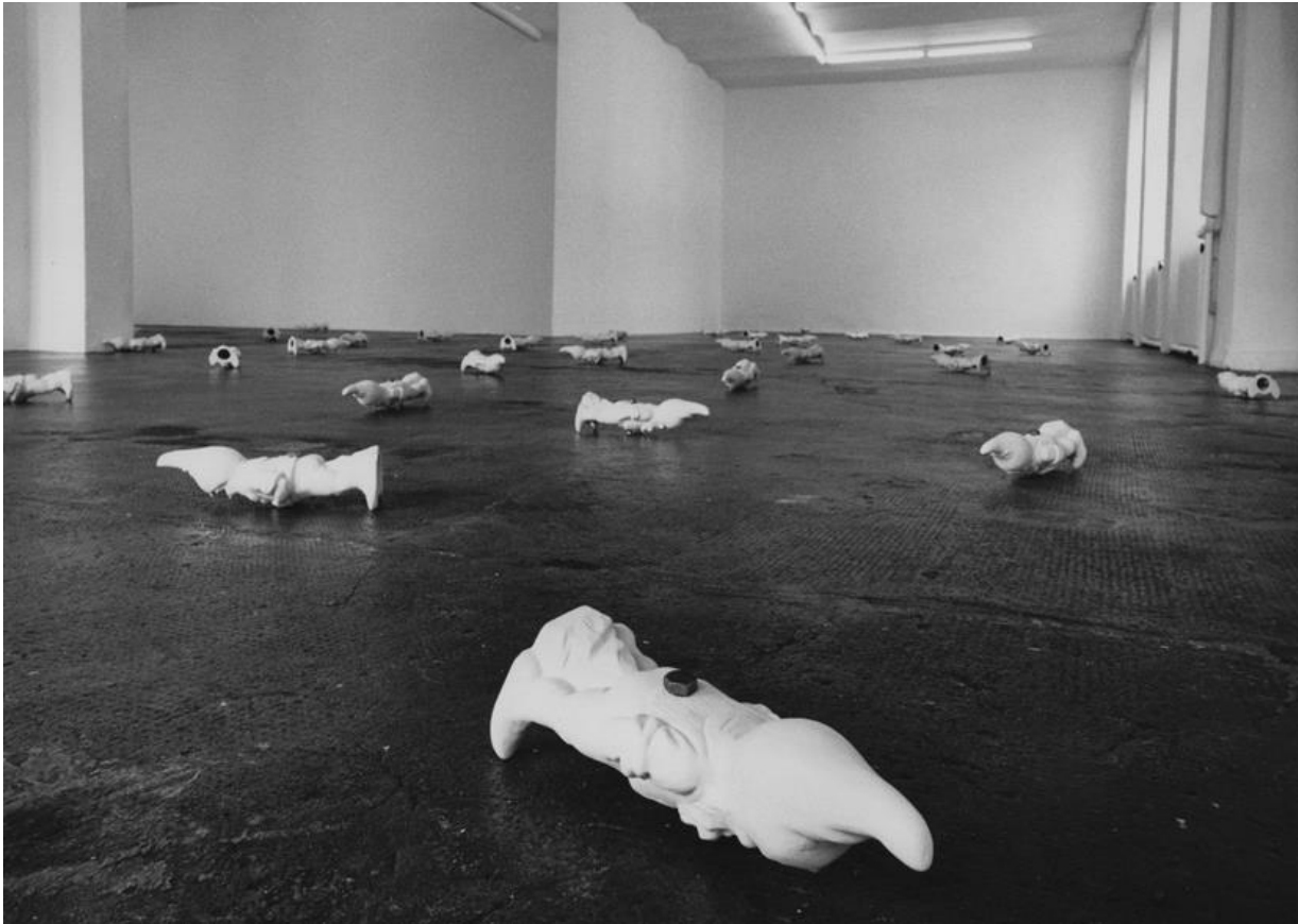
Ottmar Hörl, Gelb-Syndrom [Yellow Syndrome] , 1985, installation, galerie ak, Frankfurt am Main, photo: Galerie ak