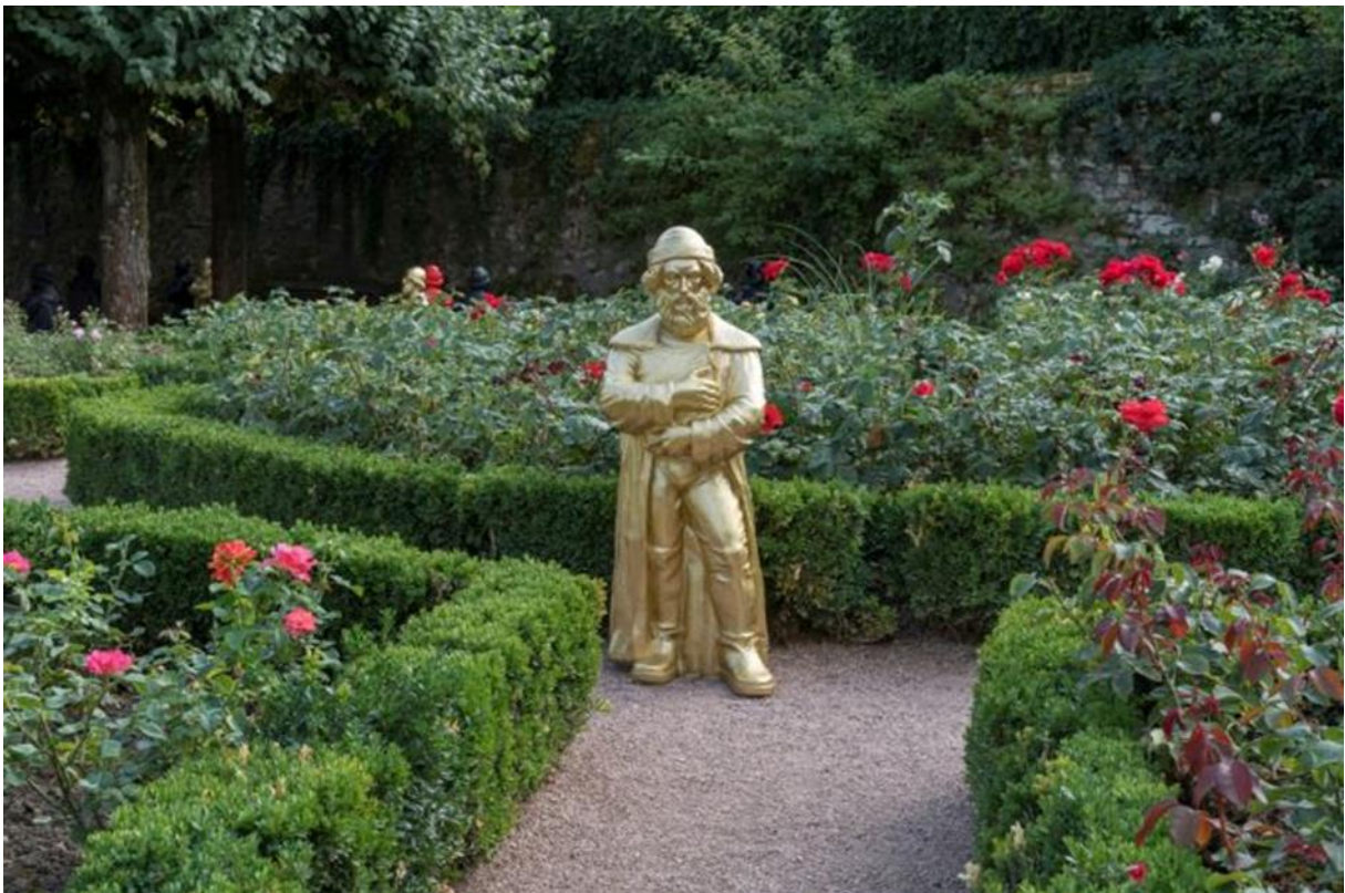
Ottmar Hörl, Black Magic: gutenberg@eltville , 2018, Eltville