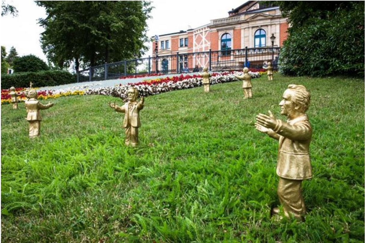
Ottmar Hörl, YOU'RE WELCOME, 2023, Richard Wagner installation, Bayreuth Festival Park