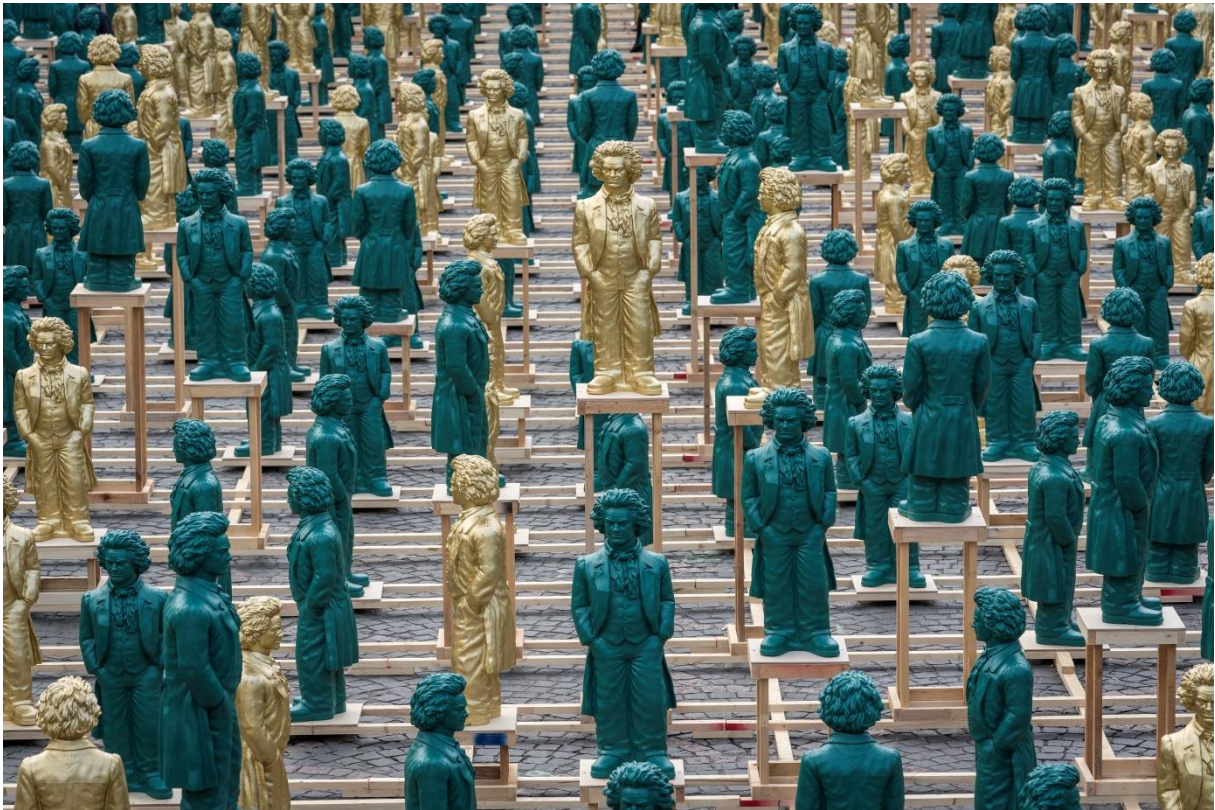
Ottmar Hörl, Ludwig van Beethoven – Ode an die Freude [Ode to Joy], 2019, Bonn