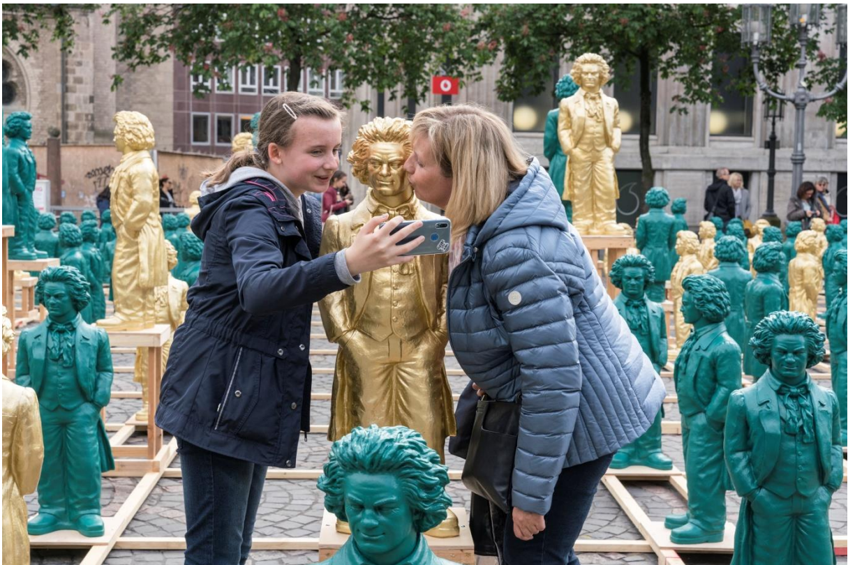
Ottmar Hörl, Ludwig van Beethoven – Ode an die Freude [Ode to Joy], 2019, Bonn