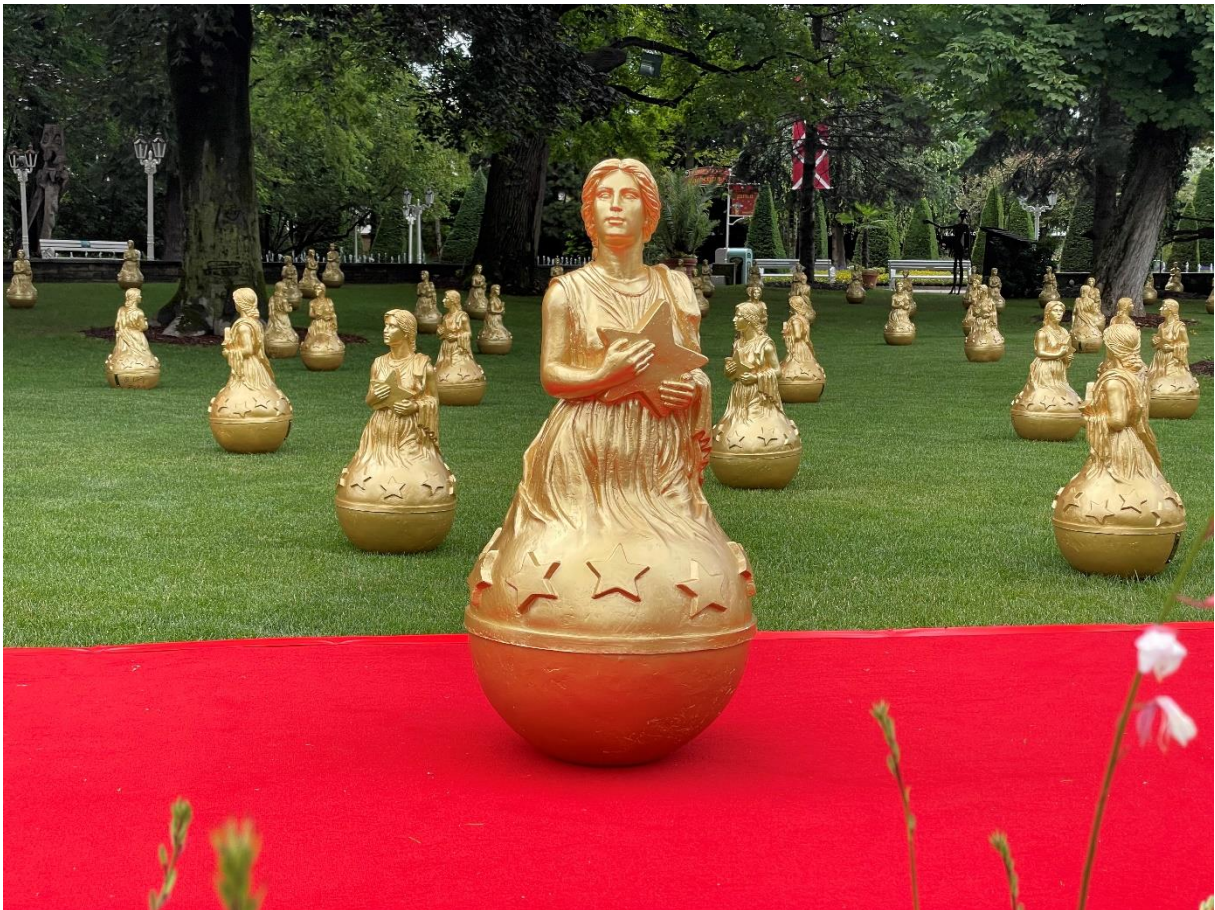
Ottmar Hörl, Europa , 2021, Europa-Park, Rust