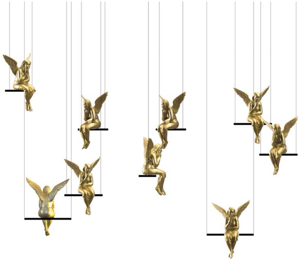
Ottmar Hörl, LUNCH BREAK , 2019, London, simulation/draft: KHBT