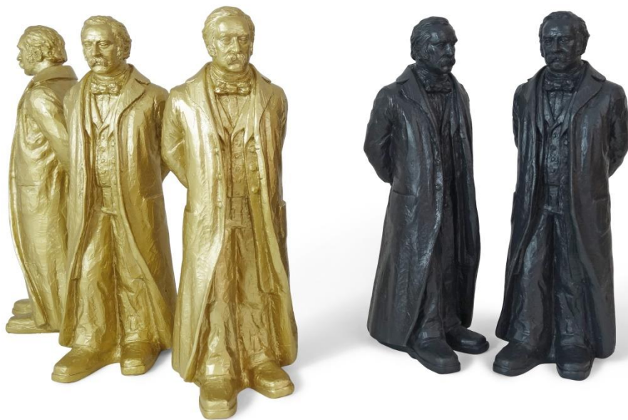
Ottmar Hörl, Fontane II special edition, 2019, plastic material, height: 42 cm