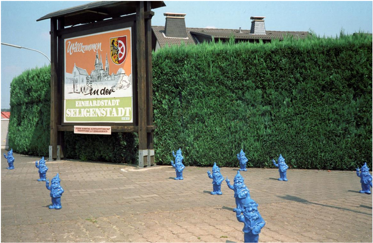
Ottmar Hörl, Fliegender Wechsel [Rolling Change] , 1994, Seligenstadt, photo: Cornelia Regner-Hörl