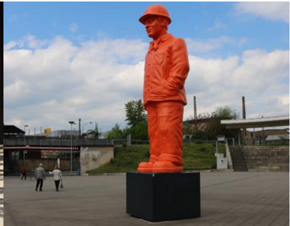
Ottmar Hörl, SECOND LIFE - 100 Arbeiter [100 Labourers] , 2018, Völklingen Ironworks World Cultural Heritage Site – European Centre of Art and Industrial Culture, Völklingen; right: large-scale sculpture, photos: Eva Schickler