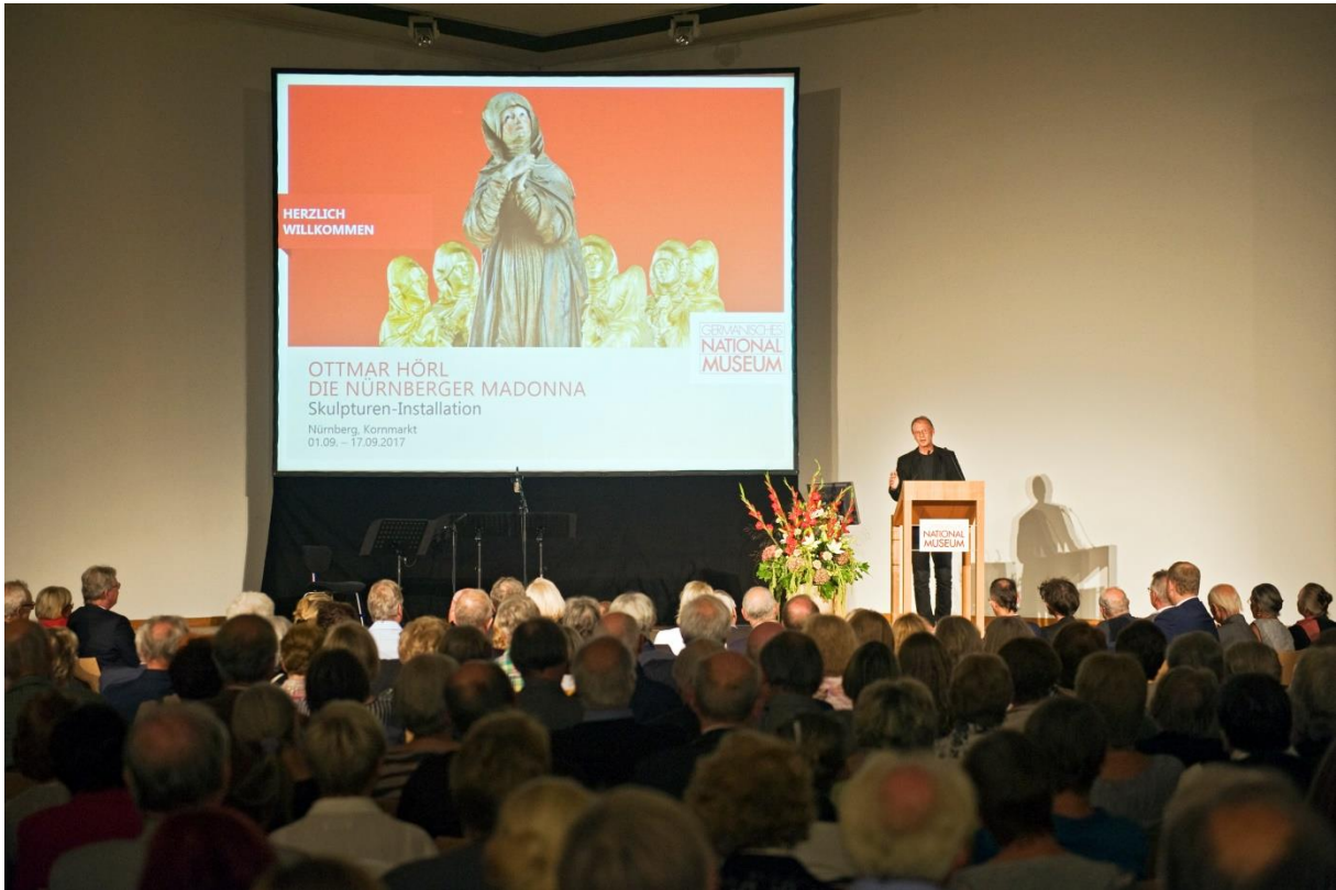
Opening of the Die Nürnberger Madonna [The Nuremberg Madonna] installation, 2017, Germanisches Nationalmuseum, Nuremberg