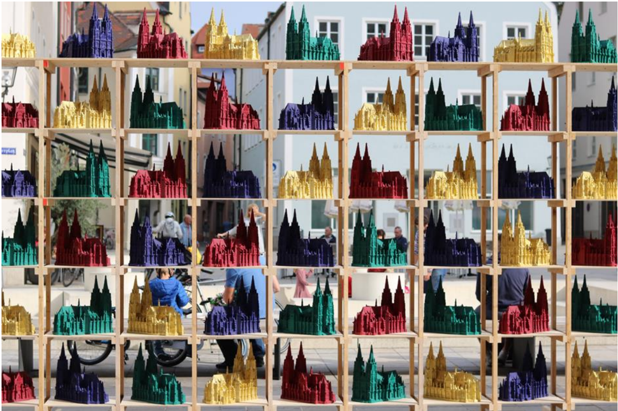
Ottmar Hörl, Souvenir, Souvenir?! , 2019, Regensburg