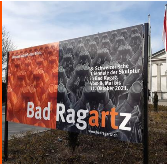
Ottmar Hörl, Weltanschauungsmodell III [Worldview Model III] , 2021, Bad Ragartz, 8th Swiss Triennial of Sculpture in Bad Ragatz