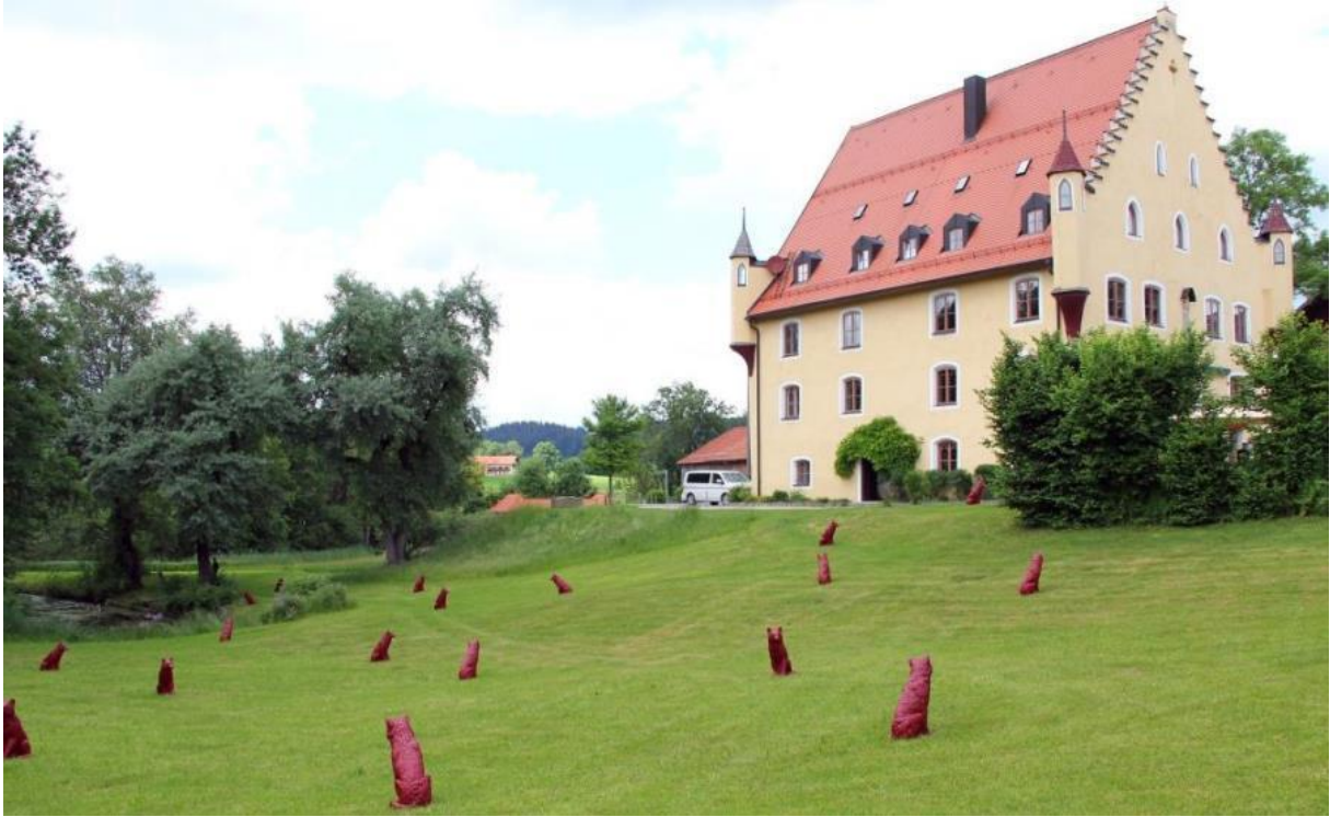
Ottmar Hörl, Wölfe im Schloss [Wolves at the Castle] , 2018, Schloss zu Hopferau