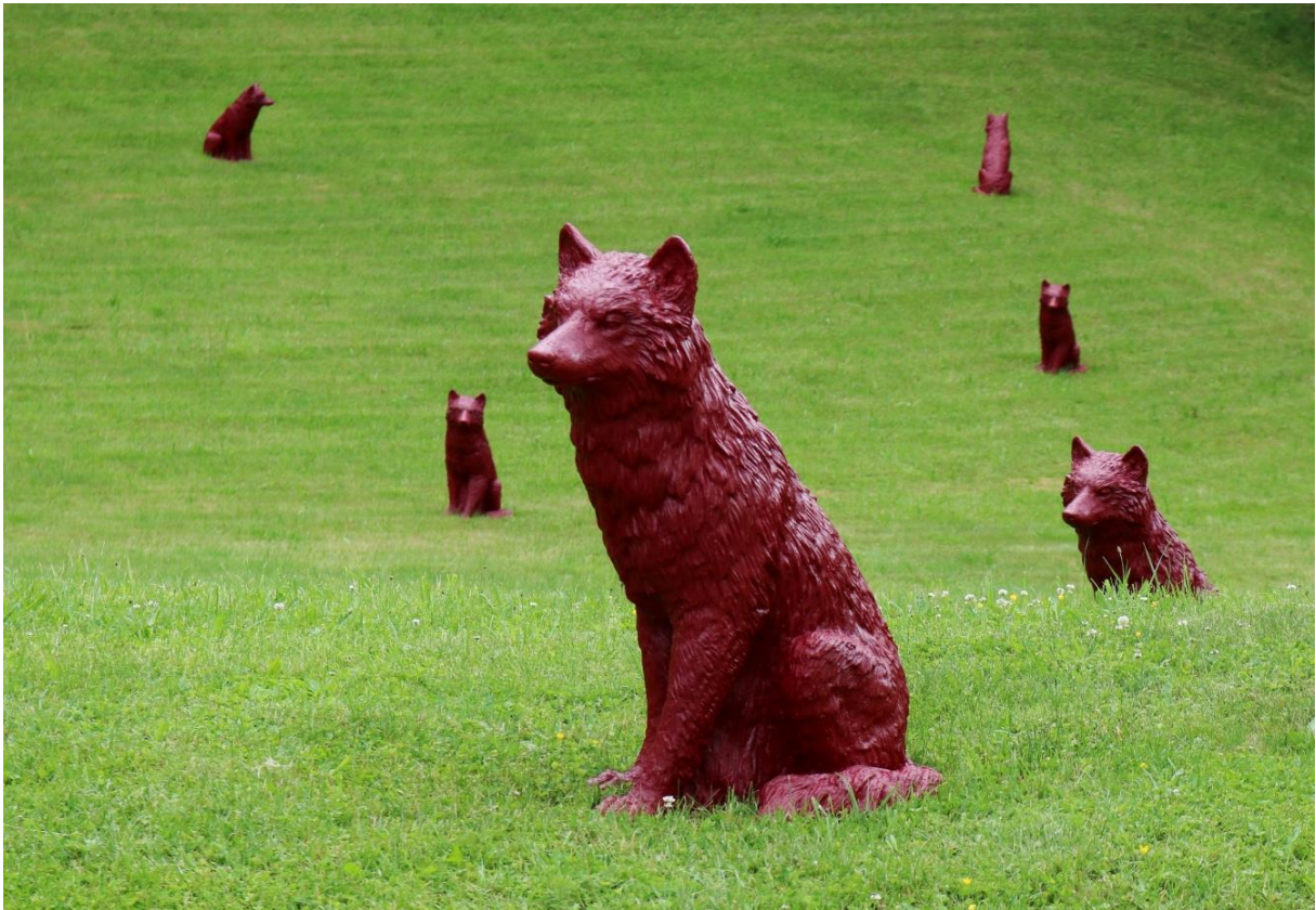
Ottmar Hörl, Wölfe im Schloss [Wolves at the Castle] , 2018, Schloss zu Hopferau