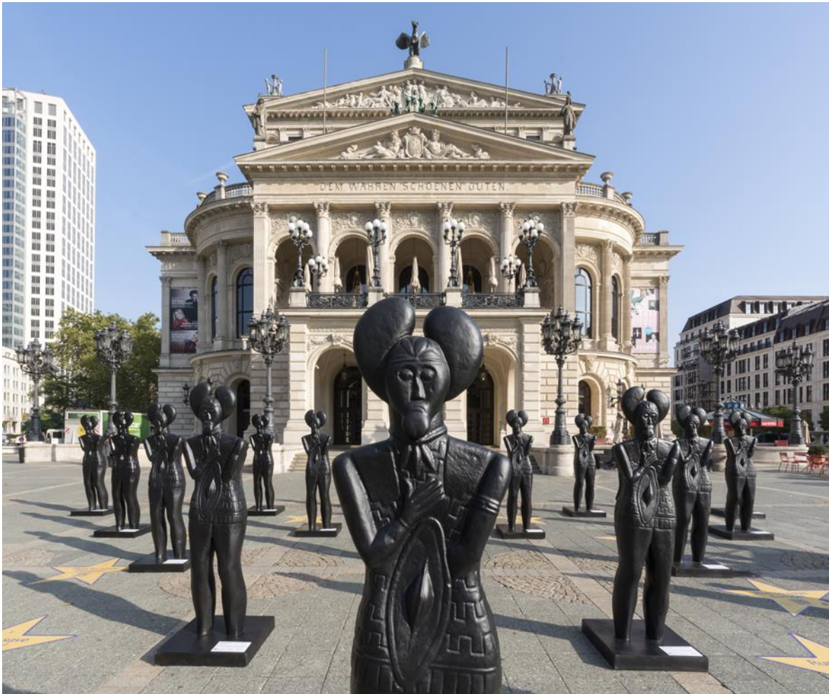
Ottmar Hörl, Keltenfürst [Celtic Prince] , 2018, Frankfurt am Main