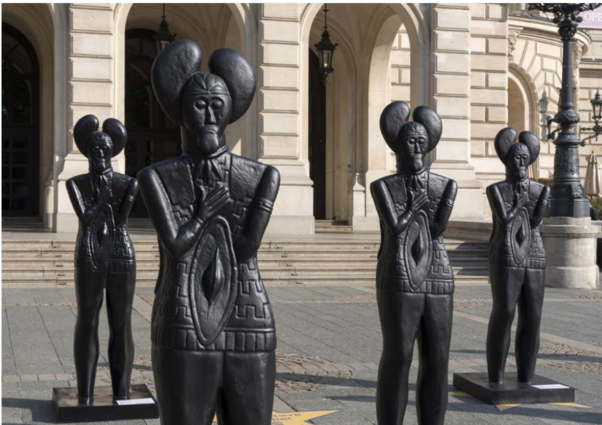
Ottmar Hörl, Keltenfürst [Celtic Prince] , 2018, Frankfurt am Main