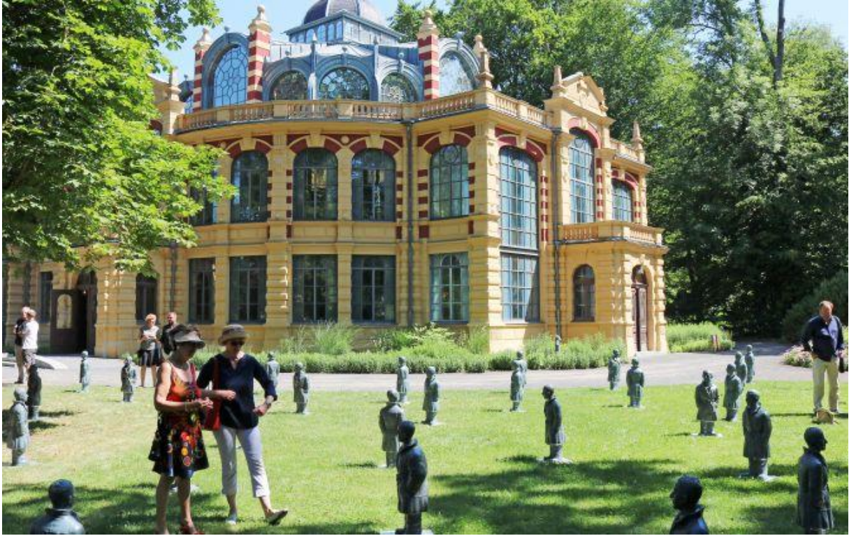
Ottmar Hörl, Bertold Brecht – per aspera ad astra , 2019, Augsburg, photo: Eva Schickler