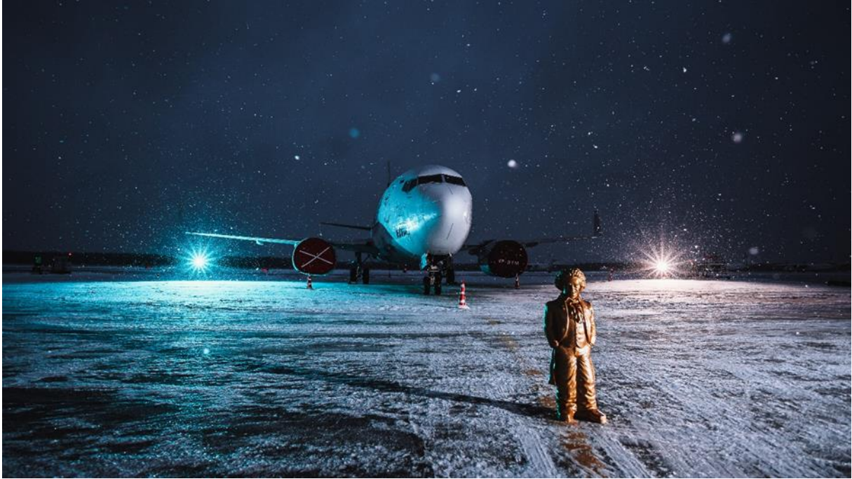
Ottmar Hörl, Beethoven Road Novel , 2020/2021, travelling installation, Russia, photo: Maxim Bezugliy