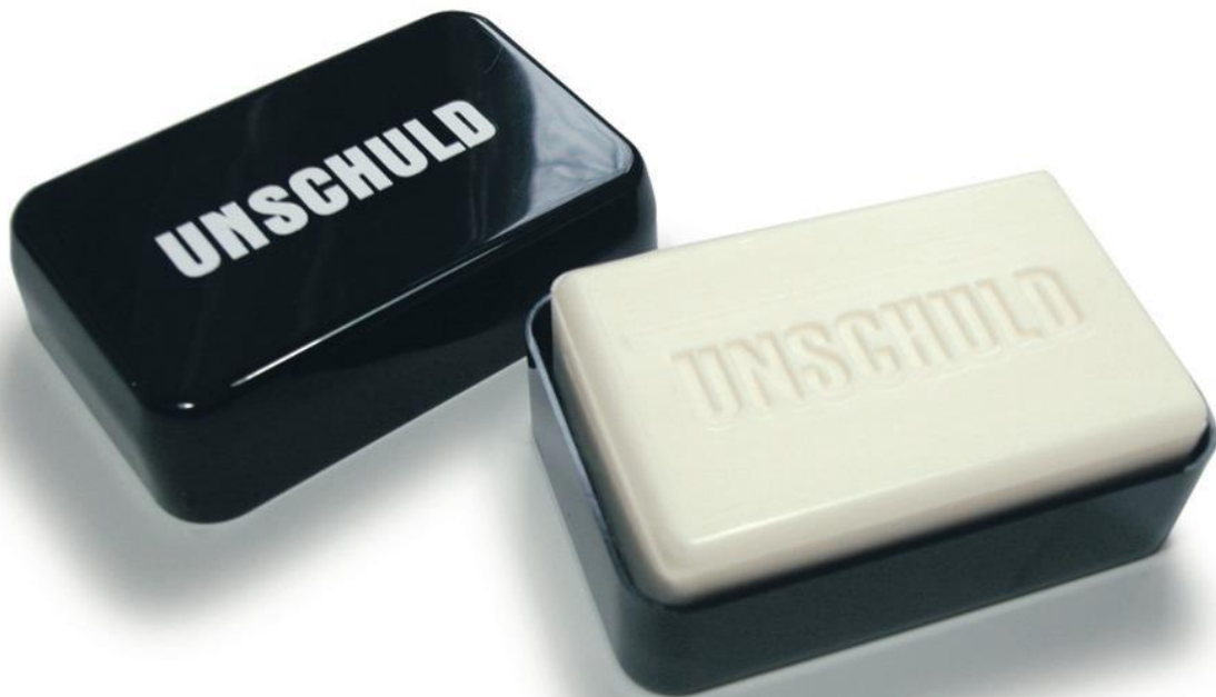
Ottmar Hörl, UNSCHULD [INNOCENCE] , since 1997, 82 million copies, Artikel Editionen