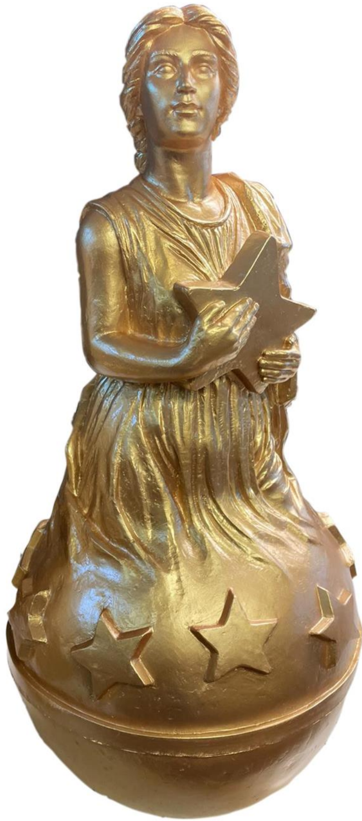
Ottmar Hörl, Europa , 2021