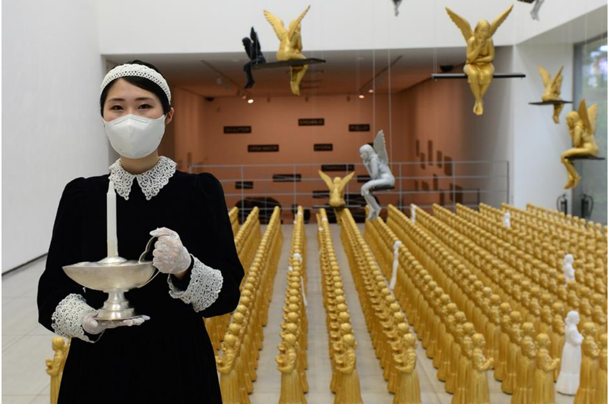
Ottmar Hörl, COEXISTENCE , 2021, Indang Museum, Daegu, South Korea