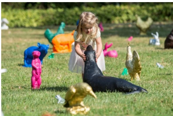
Hörl's Tierleben [Hörl's Animal Life], 2016, Waiblingen