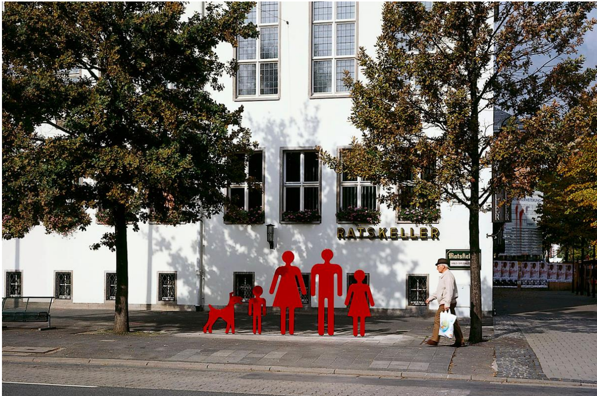
Ottmar Hörl, Familientreffen [Family Gathering] , 1992, serial steel sculptures, Rüsselsheim municipal area, photo: Wolfgang Günzel