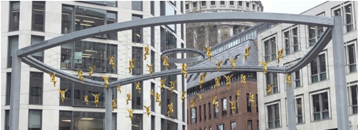
Ottmar Hörl, LUNCH BREAK , 2019, London