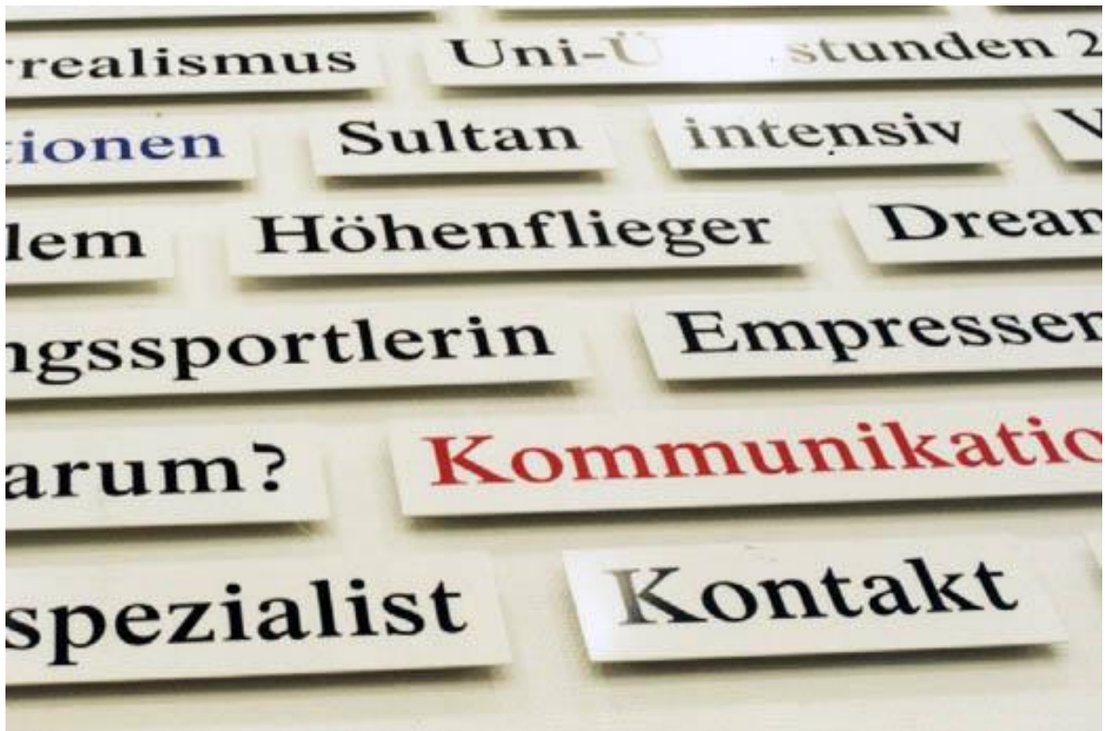
Ottmar Hörl, Wortwechsel [Verbal Exchange] , 2000, Union Investment, Frankfurt am Main