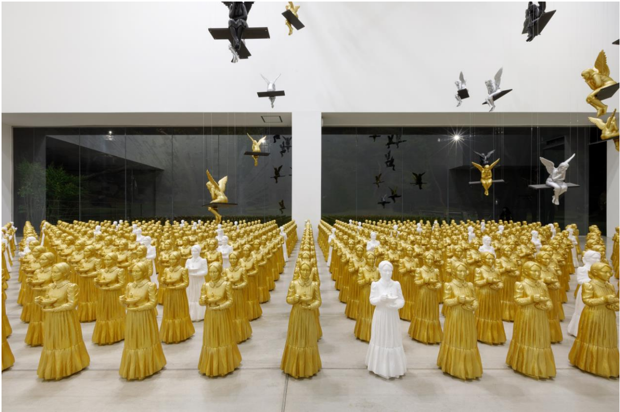
Ottmar Hörl, COEXISTENCE , 2021, Indang Museum, Daegu, South Korea, photo: Indang Museum