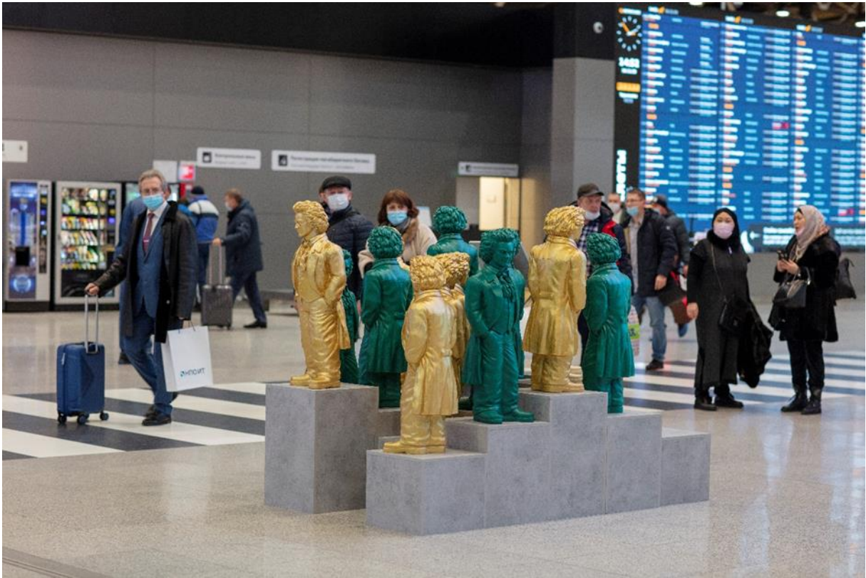
Ottmar Hörl, Beethoven Road Novel , 2020/2021, travelling installation, Russia