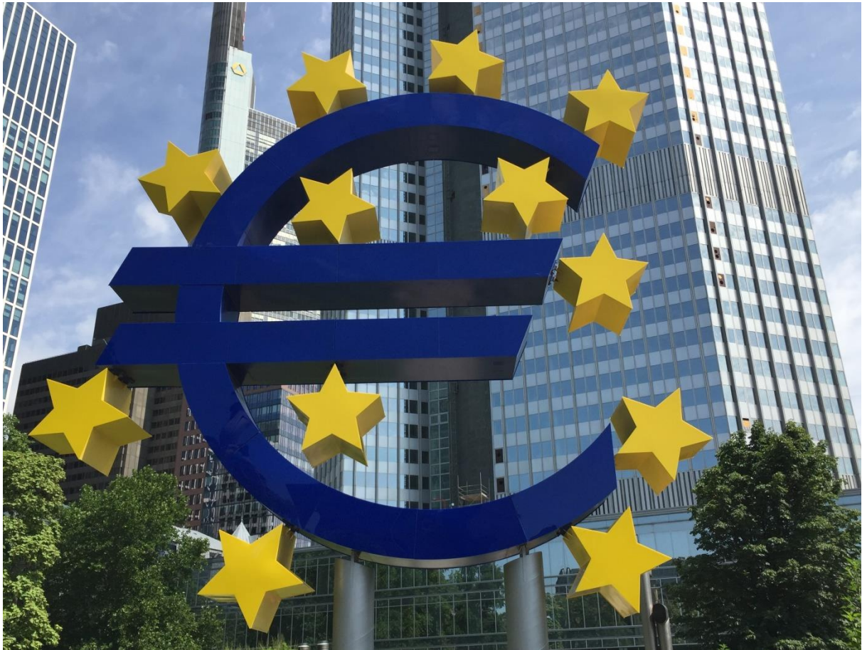
Ottmar Hörl, Euro Sculpture , 2001, Frankfurt am Main