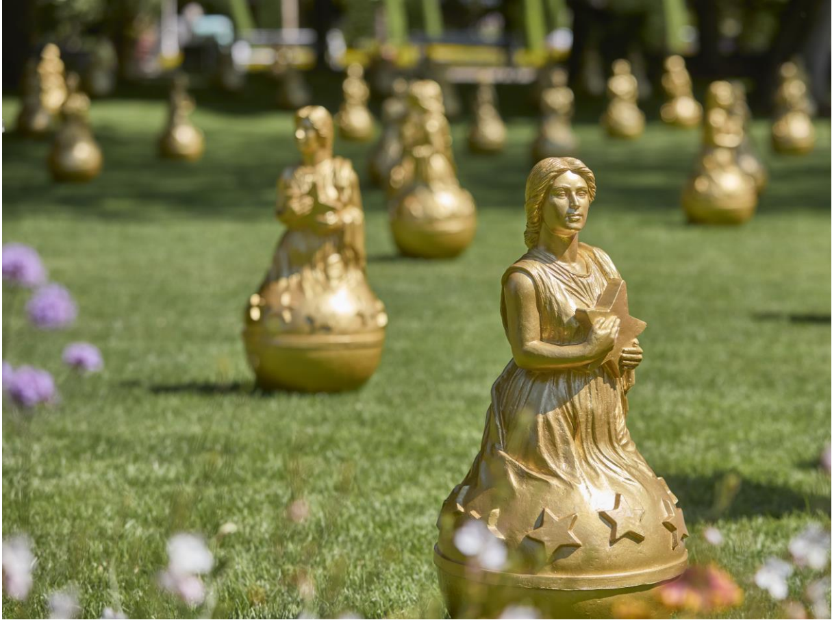
Ottmar Hörl, Europa , 2021, Europa-Park, Rust, photo: Koppelman Media