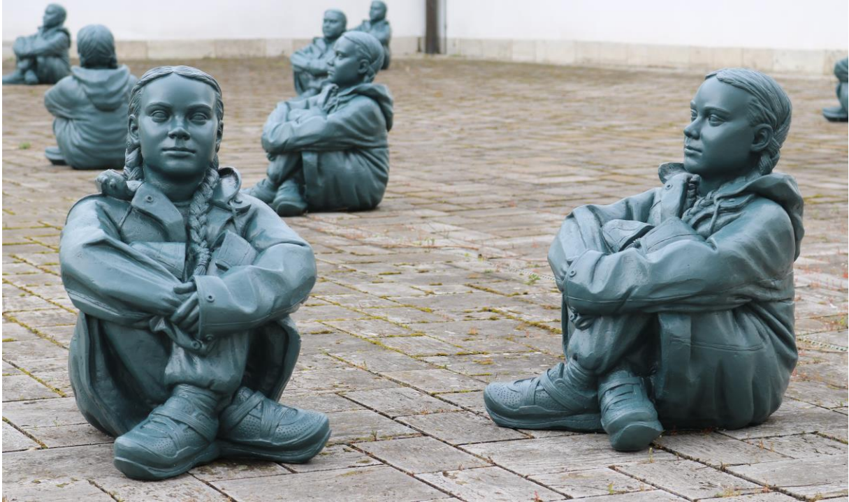
Ottmar Hörl, Gewissen der Welt [Conscience of the World] , 2022, Greta Thunberg installation, Kunsthalle Schweinfurt, photo: Eva Schickler