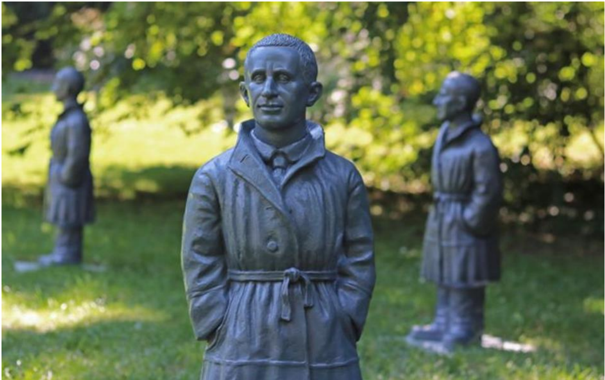
Ottmar Hörl, Bertold Brecht – per aspera ad astra , 2019, Augsburg, photo: Eva Schickler