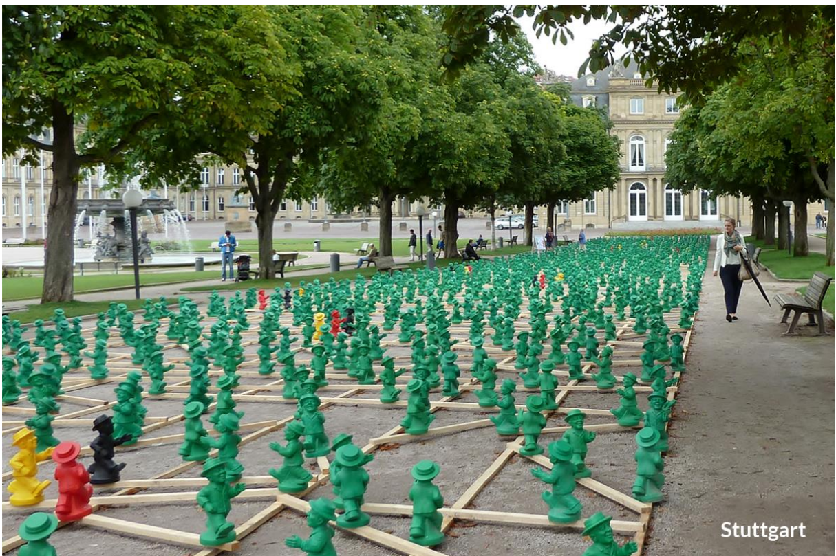
Ottmar Hörl, 25 Jahre Deutsche Einheit - Grenzen überwinden [25th Anniversary of the German Reunification - Overcoming Boundaries], 2015, installation, tour of Germany