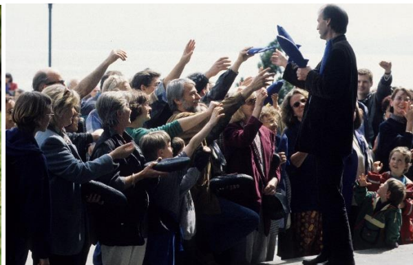
Die Speisung der Fünftausend [The Feeding of the Five Thousand], 1999, Friedrichshafen, photo: Paul Silberberg