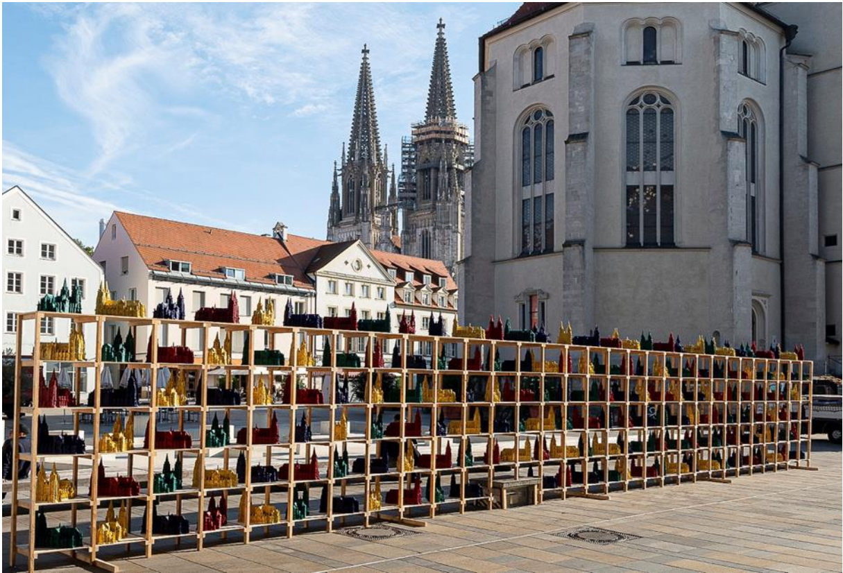
Ottmar Hörl, Souvenir, Souvenir?! , 2019, Regensburg, photo: Eva Schickler